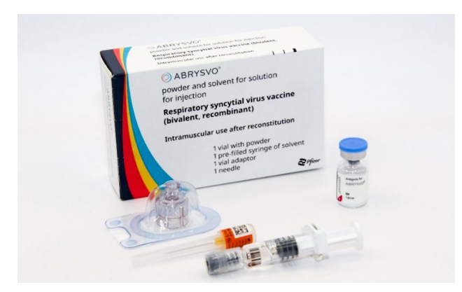
Fig 1. Abrysvo® packaging and contents

The vaccine procured and recommended for use in both programmes is the Abrysvo® vaccine which is manufactured by Pfizer. Unlike any other vaccine currently in use in the UK routine immunisation schedule, Abrysvo® requires reconstitution using a vial adaptor (which is included in the pack contents, see fig 1). Immunisers are strongly advised to watch the manufacturer's instructional video (weblink 11) before preparing and administering the vaccine.